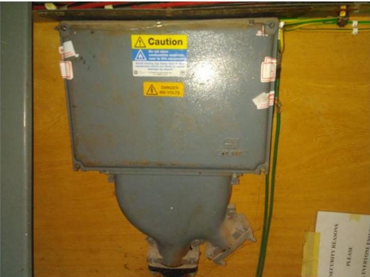
File name: 2c955469-4087-40ba-aeab-643eea97439d.JPEG